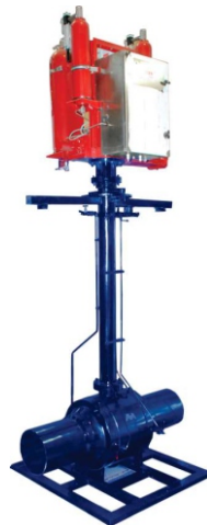
Forged fully welded ball valve with gas-over oil actuator