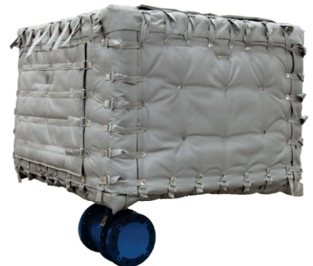
Ball valve with volume tank and accessories mounted on actuator inside fire safe enclosure