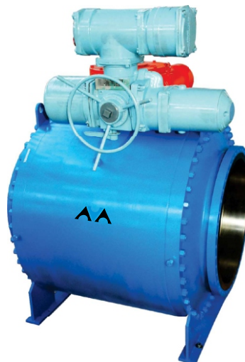
Forged body ball valve with motor operated actuator