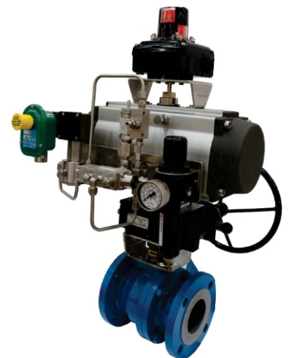
Cast body ball valve with rack and pinion actuator with accessories and handwheel