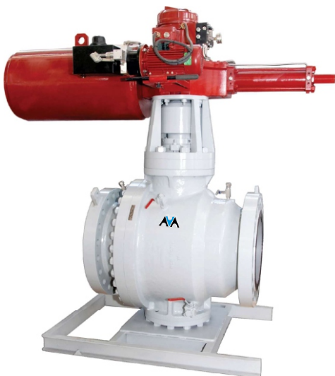
Cast body ball valve with electro-hydraulic actuator